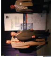
POWER's supply chain consultants at Husum Wind