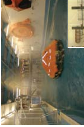
All pictures: © lowestoft College