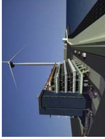
Illustration: Orbis Energy