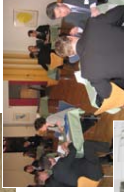
One-2-One Business Meetings