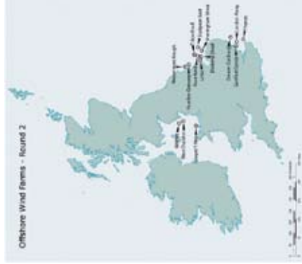
Map of Round 2 offshore wind farms

The East of England is at the forefront of the UK's offshore wind market. The region is located between two large scale "Round 2" development areas for offshore wind farms, the Greater Wash and Thames Estuary, where more than 6 GW offshore wind capacity is planned over the next 8 years. The ports of Lowestoft and Great Yarmouth are in the centre of these developments. Both ports have been used during the construction of the Scroby Sands Offshore Wind Farm.