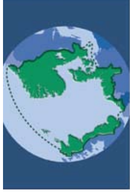
The North Sea Region