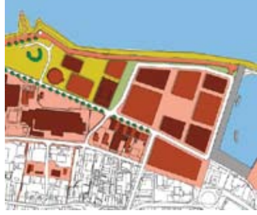
1st East's illustrative plans for the Power Park

Further information at www.orbisenergy.net www.1steast.co.uk www.eastport-gy.com