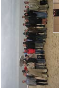
German delegation at Scroby Sands